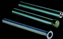
② Horizontal axis